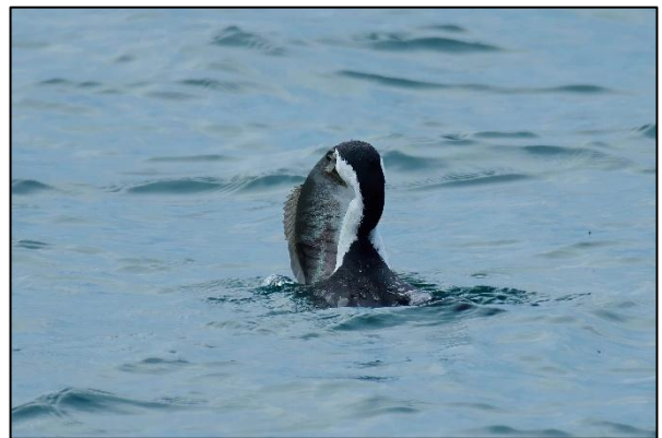
Down the hatch!

Peter Fackender took some photos of a very cheeky Pied Cormorant that stole a fisherman's catch. Many on the Pelican Park/Picnic Island walk observed this and spoke to the narked fisherman afterwards. Note the fish still had the hook and length of fishing line attached when the bird swallowed it.