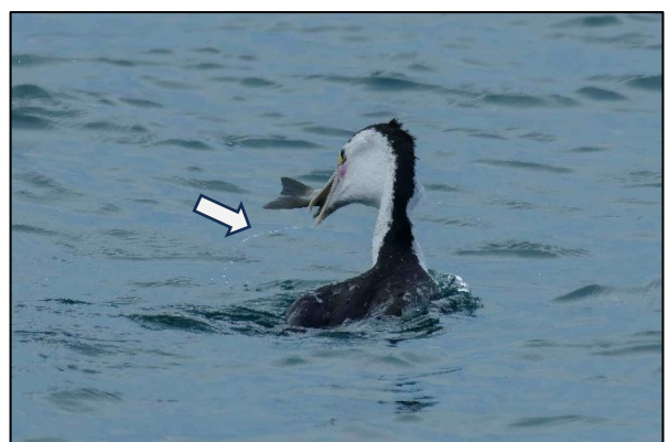
Look closely to see the fishing line