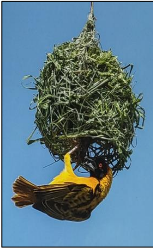
Village weaver nestbuilding

it's classified as near threatened. There's much, and more optimistic, literature about the village, or black-headed, weaver of the sub-Saharan region and, on account of its adaptive and gregarious behaviour, has spread successfully in some islands in the Indian Ocean and the Caribbean Sea; in the IUCN Red List it's deemed of least concern. Often suspended from a branch and with the entrance hole in the base, the nest holds some breeding protection from predatory snakes and raptors, but is not foolproof. I assume neither egg nor chick ever fall out.