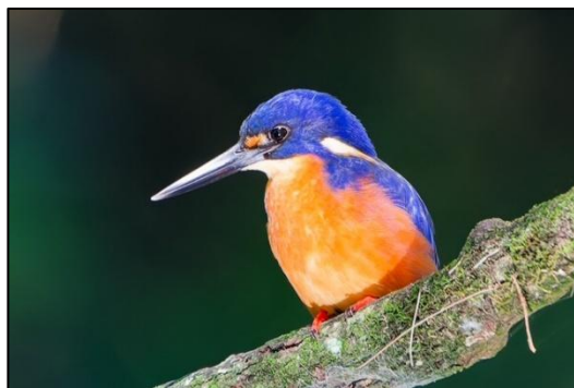
Azure Kingfisher at Woko N.P. Pam Hazelwood