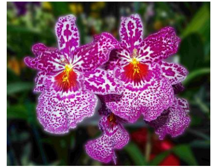
One of the many colourful orchids Richard will discuss

Please bring a plate of goodies and a mug for supper after the meeting.