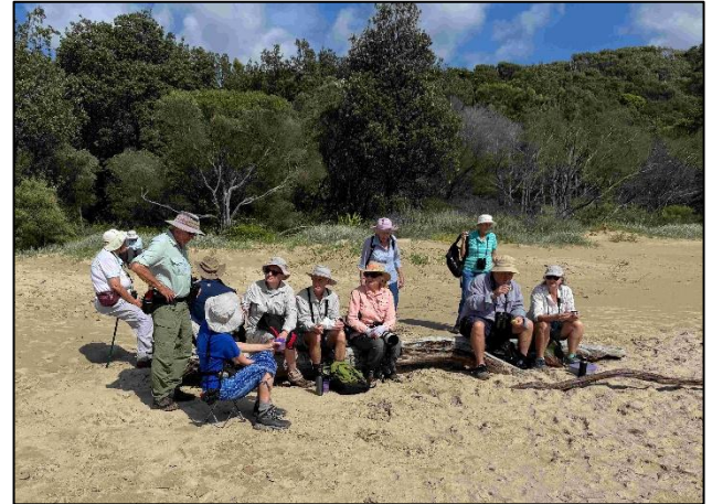
Morning Tea on the Beach (Ken Brown)

mostly out but not too hot and a gentle breeze. There were several large flocks of Silver Gulls along the beach. Several hundred, but impossible to count exactly. As far as we could see there did not appear to be any Terns in amongst them.