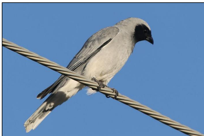
Black-faced Cuckoo-Shrike