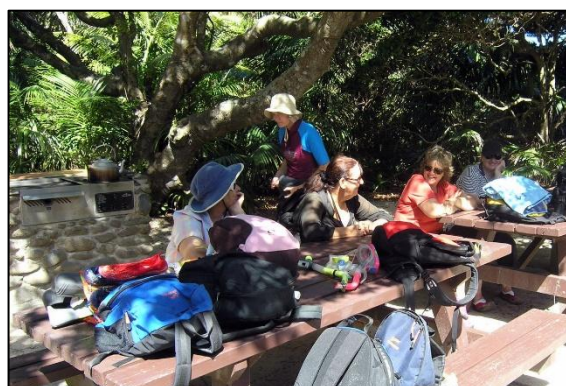
Relaxing on Lord Howe Island 2008 (Chris. Cartledge)

PPS: IBOC Members may remember the wonderful 'camp' the Club organised on Lord Howe Island in February 2008. We should do it again!