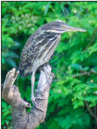
Juvenile Black Bittern (1/3) Macquarie Rivulet (24/2/25) Pam Hazelwood