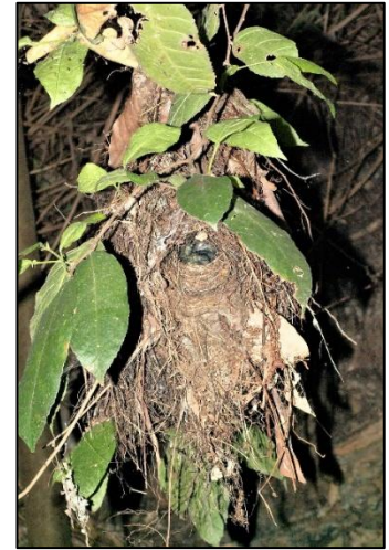
YTSW's nest with chicks in Excelsior

The siting and construction of the village weaver's nest made me think of that of a different passerine architect much closer to home, the yellow-throated scrubwren (aka devil-bird). Its taxonomic name Sericornis citreogularis means lemon-throated silk bird. For a very brief period in May 2017, I had the privilege of having a sole representative male (with black 'mask', not the female's brown) scouring my Thirroul backyard. But over the years I've enjoyed many a sighting in the neighbouring Excelsior bushland. Nests have been built in gloomy parts of the forest and more often suspended over a watercourse and with an entrance hole usually well above the base. Many years ago, a local butcher told me that in his youth he and his bush-adventuring mates used to call them hanging dickies. If this vernacular is accepted birding parlance, how might a compiler word the clue (7-7 letters) for such an answer in a cryptic crossword?