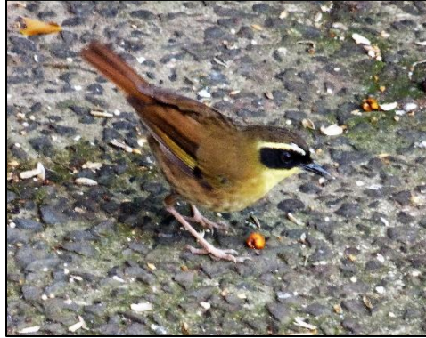
Yellow-throated Scrubwren in backyard